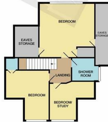
1ST FLOOR APPROX. FLOOR AREA 652 SQ. FT. (60.5 SQ. M.)