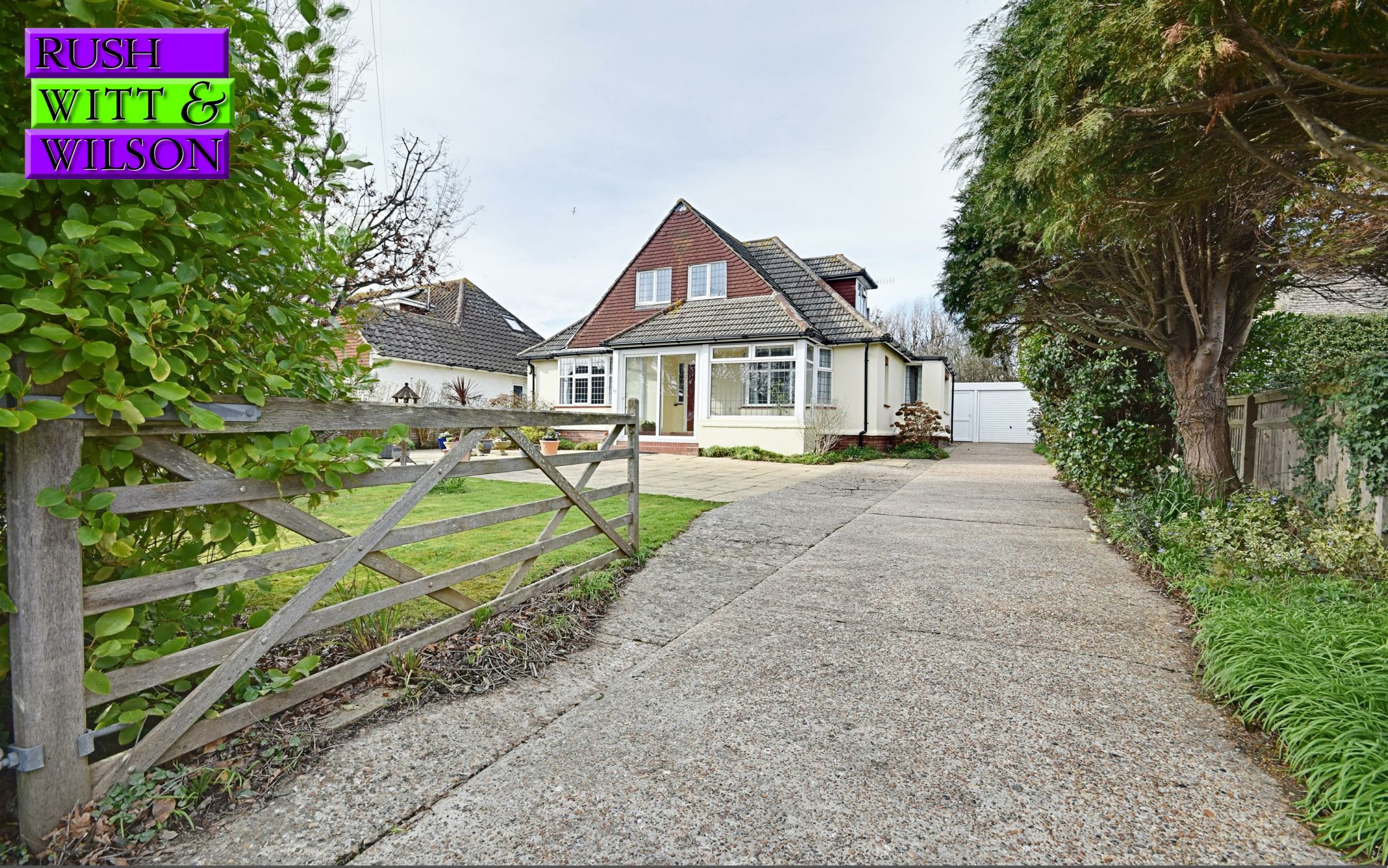
52 Cooden Drive, Bexhill-On-Sea, East Sussex TN39 3AX £550,000